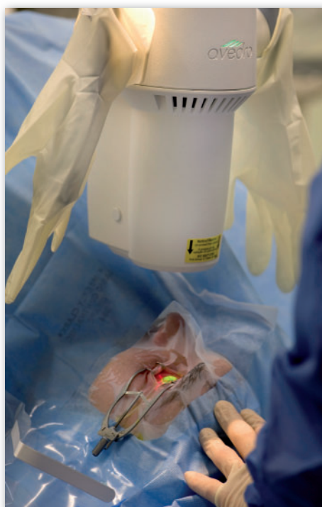
■ Using the new Corneal Collagen Cross-Linking Device