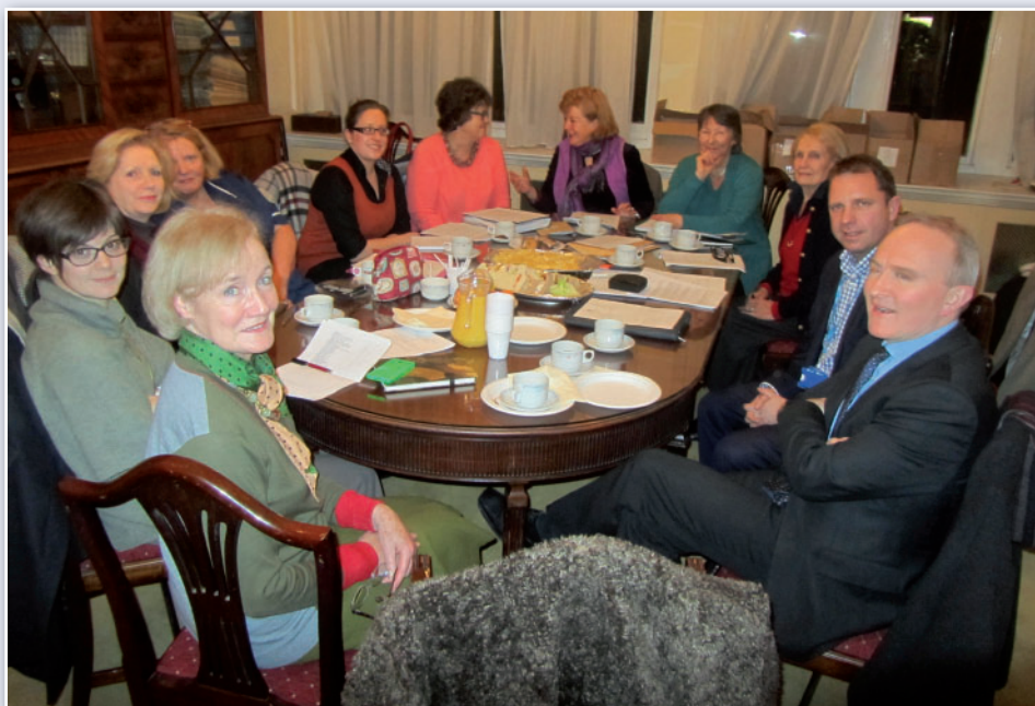
■ Friends Trustees at their meeting in November 2014