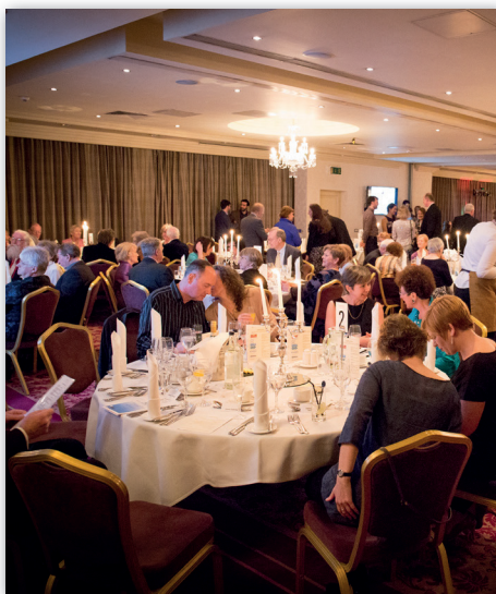
Bristol Hotel Ball Room

night with the surgeons' band "The Four Fifts". A disco followed for those still standing!