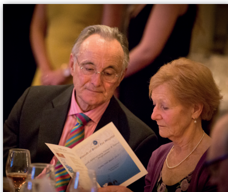
Guests reading the programme

Over 140 revellers - members, hospital staff, other supporters and their guests - gathered at the Bristol Hotel on 24 March 2017 to celebrate our 40th anniversary.