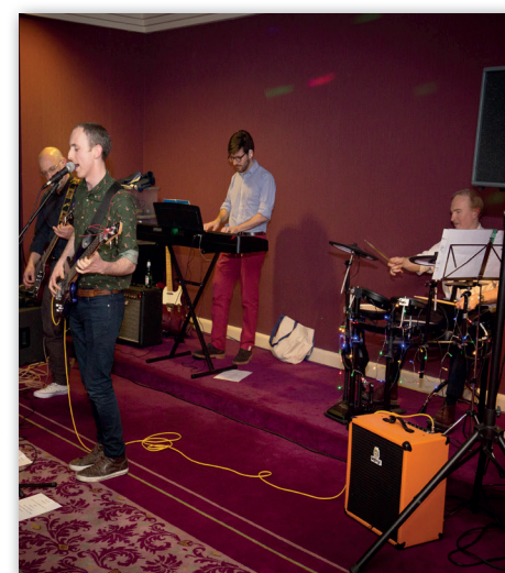
The Four Fifts